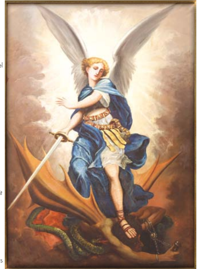
Archangel Michael from St. Peters Church in Old Jaffa, Tel Aviv, Israel from circa end of 19 century.