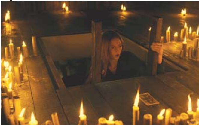
Someone's been leaving the attic light on again!